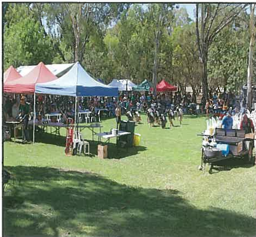
Honouring the Stolen Generations at Veale Park 13 February 2020